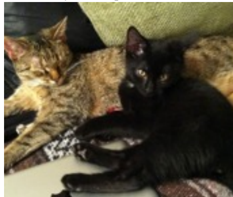
Harriet & Lumpy

CASAS strives to make ownership as easy and cost effective as possible. Spaying and neutering is done before the cat leaves the shelter. CASAS provides financial assistance for people with limited monetary resources who obtain a cat from elsewhere. Your cat receives all shots and necessary medical care before adoption.