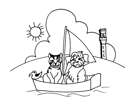
CARRIE A. SEAMAN ANIMAL SHELTER PROVINCETOWN

CASAS Carrie A. Seaman Animal Shelter 5 Sandy Hill Lane P.O. Box 1374 Provincetown, MA 02657-5374 508-487-4243 www.casasanimalshelter.org