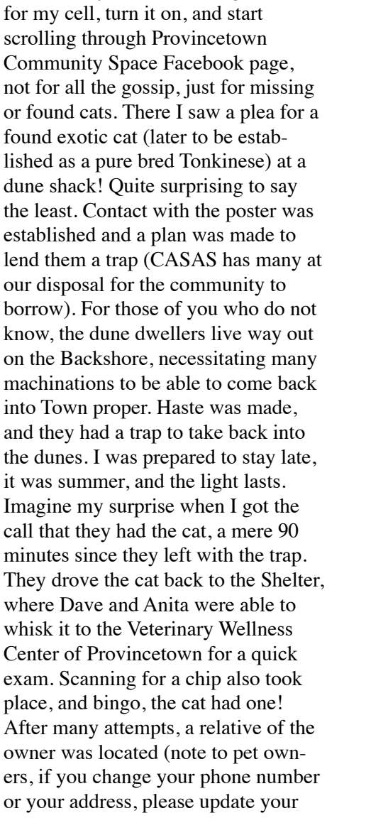
information with your microchip carrier). The cat had escaped from a house in Truro nearly 3 months prior,

Java My morning started like any other, grabbing those great last moments in bed with for my a