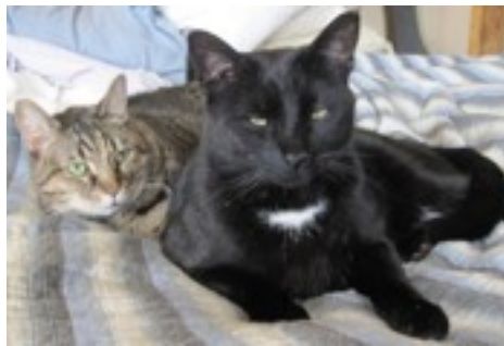
Pasha in her new home with her boyfriend Craisin