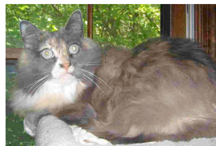
Shayna, Most Beautiful