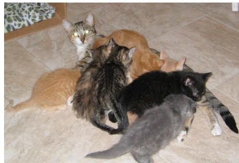
Otis and her many babies

This is the kind of thing that makes the long hours at CASAS so joyful. Jane and Otis are both spayed and now available for adoption; the boys from each litter have been neutered and most of the girls are reserved and will go to their forever homes as soon as they are spayed.