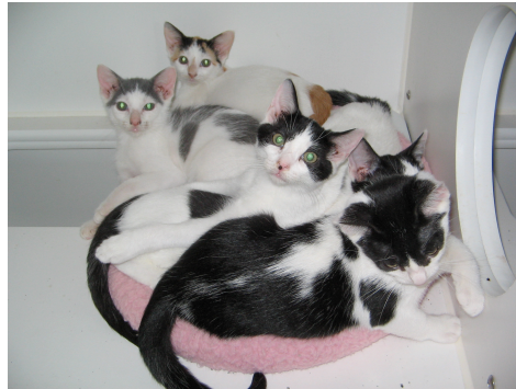
Bandit, Good Fortune, Peanut, Tippy, Yosemite, Panda