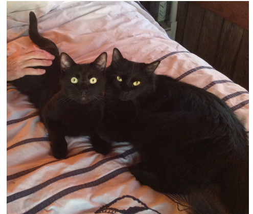
Simon & Keeper

Call to CASAS. Locals looking for a black male kitten. Yes, we have a litter, one is a black male! Come check him out. They fell in love. He was two months old, left with them, basic shots in tow. As we do for most kittens, we let them go to their forever homes and follow up to get them spayed or neutered and final shots. Early time spent bonding with their forever people is very important to us. Caveat: gender identification can be difficult sometimes in the young ones. Pre-op visit for "Sage" determined he was a she. They said they would "Keep Her," hence her name. Fast forward another year. We received an obviously intact young black male cat. I took pictures prior to his snip. The same couple was interested and they met him post-op. Luckily, I had the before pictures to assure them he indeed was a male. Now Keeper and Simon are the best of pals. He calmed her, I'm sure she enchants him, although I am told there are throw downs everyday between them, in love I am pretty sure.